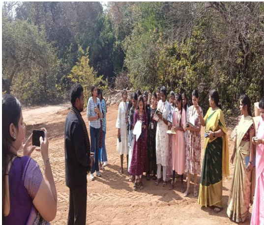
Guide explaining about the deer park