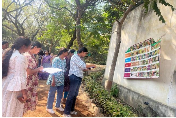
Different varieties of Butterflies