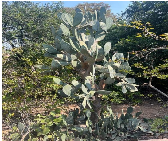
As part of their ecosystem study student observed the cactus Opuntia