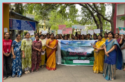
International Plastic Bag Free Day