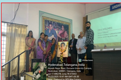
State level Seminar