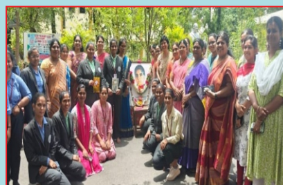
Durgabai Deshmukh Jayanthi