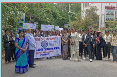
World Population Day