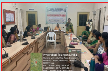
Faculty Development Programme