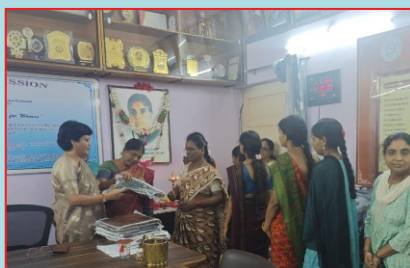
Durgabai Deshmukh Vardhathi