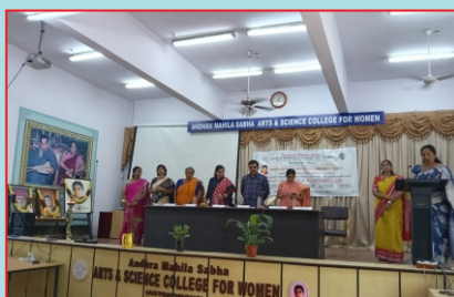
Women's Teachers Day