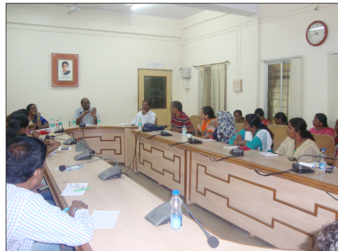
Non-Teaching Staff Human Values & Professional Ethics