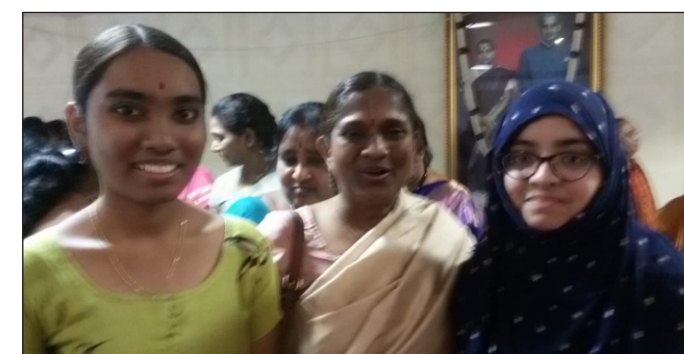
The Prize Winners with the Chief Guest on Durgabai Deshmukh's Birthday Celebrations