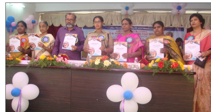
Magazine (Srujana) Released (Annual Day)