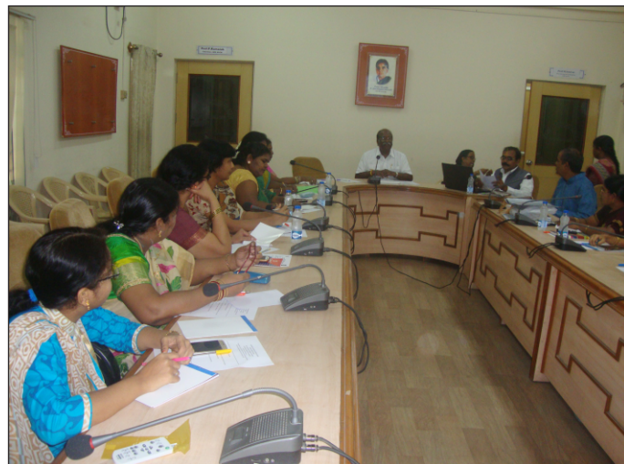
Teaching Staff Human Values Programme

It was very useful workshop making the participants realise the innerself and the do's & don't.