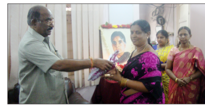
Sarees Distribution to Aayas (Durgabai Deshmukh Vardhanthi)

Responsibilities gravitate to the person who can shoulder them. – Elbert Hubbard