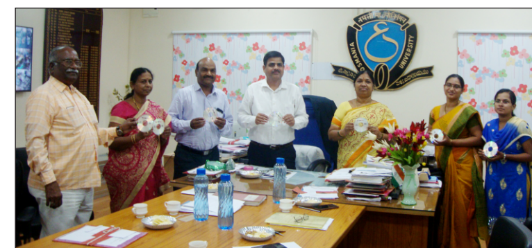
RESULTS DECLARED on 13 th June 2018 for UG & 22 nd July 2018 for PG